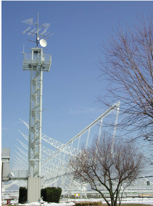
Figure 1 The 22mt Medicina RFI monitoring tower.

A 20MHz bandwidth around 408MHz has been scanned, obtaining the result shown in Figure 2.